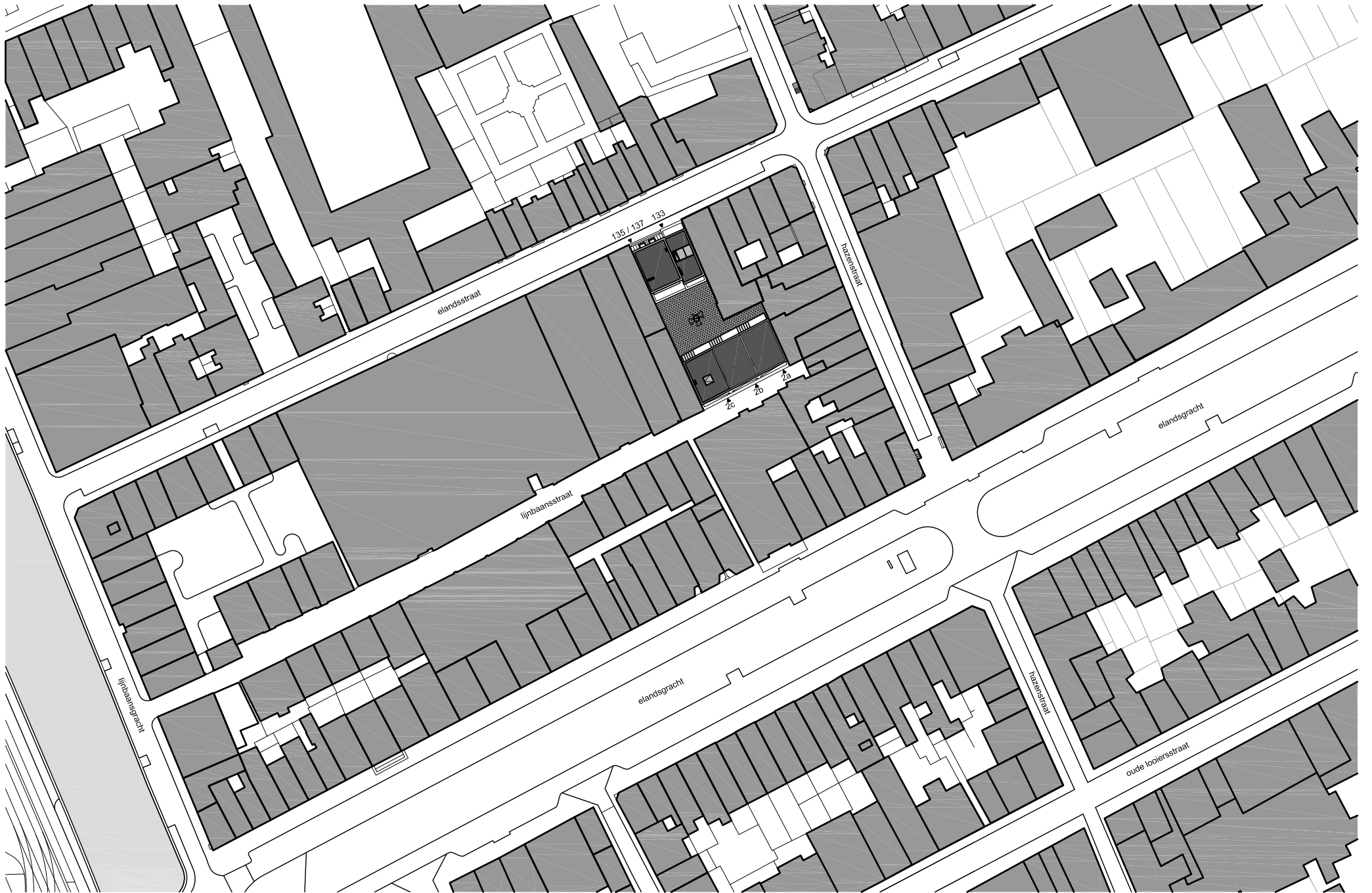
situatietekening, schaal 1:1000