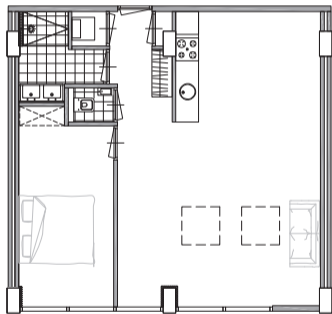
plattegrond type D