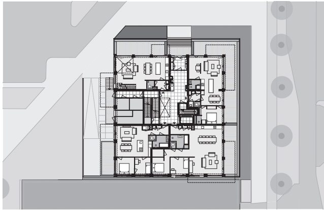
situatie met begane grond