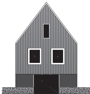
gevel blok 6