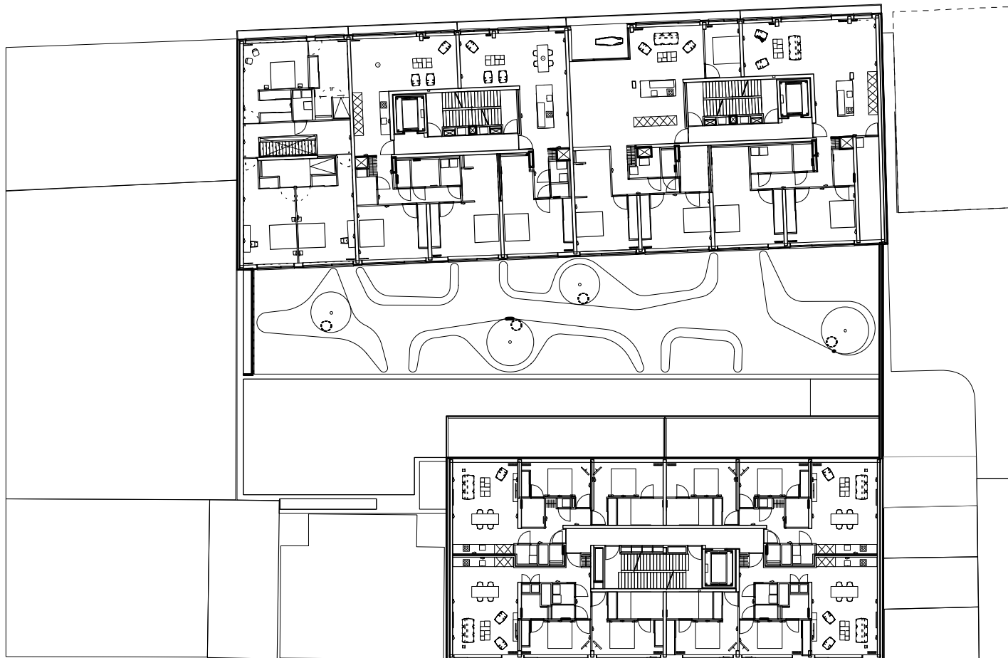
FIRST FLOORPLAN 1:400